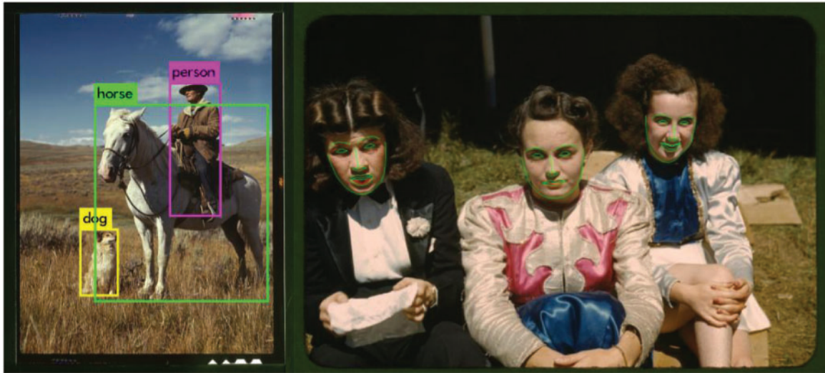
Fig. 1 Detected features in two color photographs from the FSA–OWI archive, a collection of documentary photography taken by the United States Government from 1935 to 1943. The left image shows detected images from the YOLOv4 algorithm (Redmon et al. , 2016): a horse, a person, and a dog. The library can detect 9,000 classes of images. On the right are detected facial features—such as the location of eyes, nose, mouth, and jawline—from the three women as detected by the dlib library (King, 2009)

(Smeulders et al. , 2000, p. 1375). The challenges of interpretation of visual material is further expounded when studying large corpora by applying the process of converting images into a coded system with an automated logic. 6