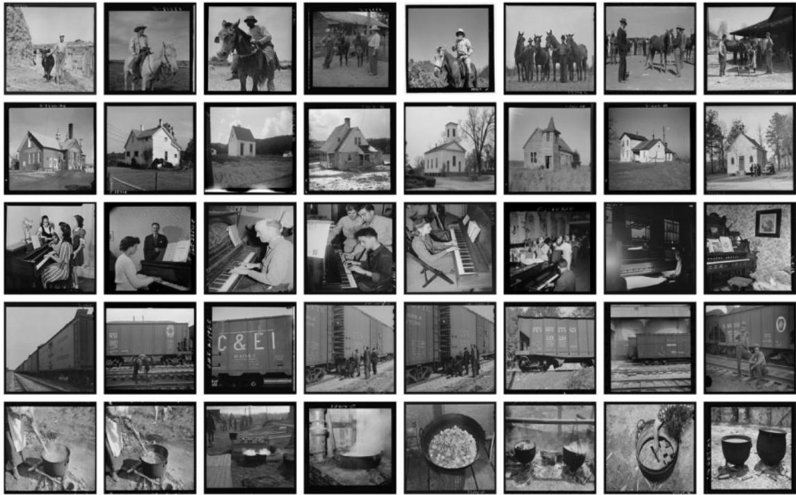
Fig. 3 The left column of this grid of photographs shows images selected from the FSA–OWI archive, a collection of documentary photography taken by the United States Government between 1935 and 1943. To the right of each image are the seven closest other images in the collection using the distant metric induced by the penultimate layers of the InceptionV3 neural network model (Szegedy et al. , 2015). Notice that each row detects images with a similar dominant object: horses, wooden houses, pianos, train cars, and cooking pots